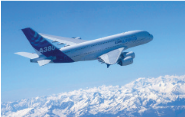
Airbus A 380, reference for APF implementation at customer site

responsible for full APF support, including process development, system integration and service, program transfer, back-up capacities and so forth.