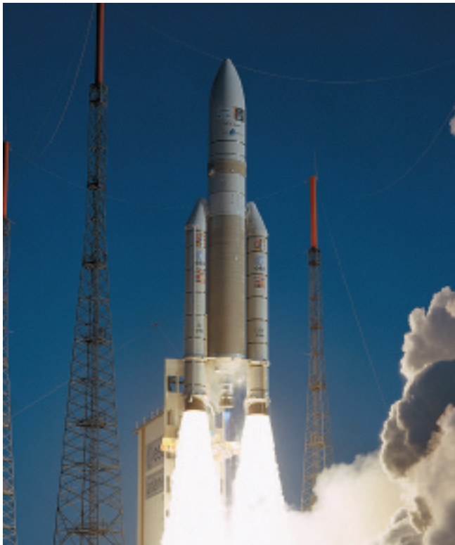
Ariane 5: KSA's 'launch' customer